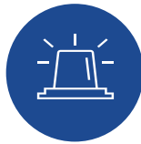
Access Control Features & Integrations